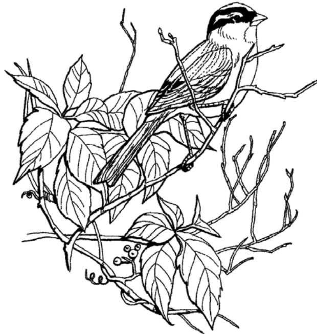
WHITE CROWNED SPARROW

Ospreys over Algona-Pacific on 3/28 (CW/NW). Twelve Caspian Terns at Des Moines were new arrivals on 4/12 (Twtrs). A Lesser Yellowlegs was found with a few Greater s at the 204th Street flooded field 4/1 (KA). A Northern Pygmy-Owl was calling again at the Green River Comm. College 3/31 (MV). A Short-eared Owl was at Kent Ponds (GRNRA) on 4/14 (RO). A