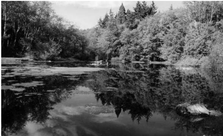
OPEN WATER AT HYLEBOS PARK