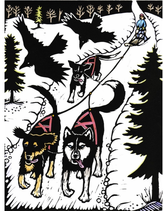
Dog Days, Raven Nights

Please plan to attend this final program of the season. It promises to be a very entertaining and educational presentation. What better way to welcome in the summer than with sled dogs and ravens. As always, refreshments and conversation will be available before, during and following the program.