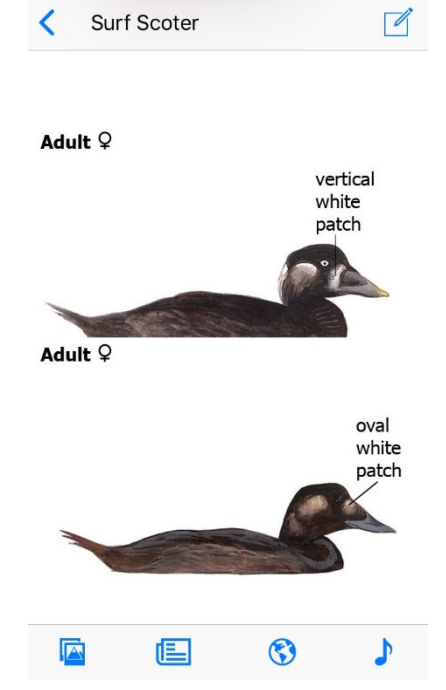
FIGURE 1 SIBLEY APP COMPARISON SURF SCOTER AND WHITE-WINGED SCOTER FEMALES

The Puget Sound region was under a Wind Advisory: high winds with wind gusts up to 40 mph. And today, of all days, was our monthly Puget Sound Seabird Survey at Brown's Point Lighthouse, Dash Point State Park and Dumas Bay Wildlife Refuge.